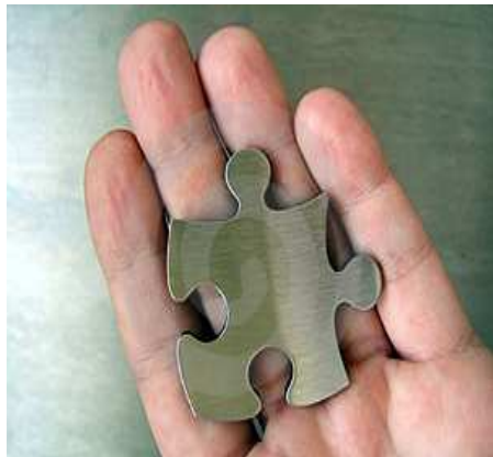
The Victor PTSA is in your hands. Join today!