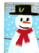
Happy Snowman By Ahmed Gardezi

For a better look — and to order online — visit http://www.casajc.org/holiday_card.htm