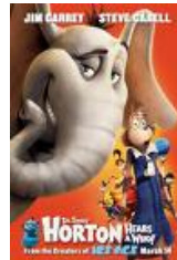
“Horton Hears a Who”,