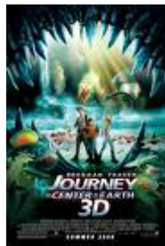
“Journey to the Center of the Earth.”

Polls will close March 2 nd . Sign up sheets will arrive home in late February and early March for reservations for this event.