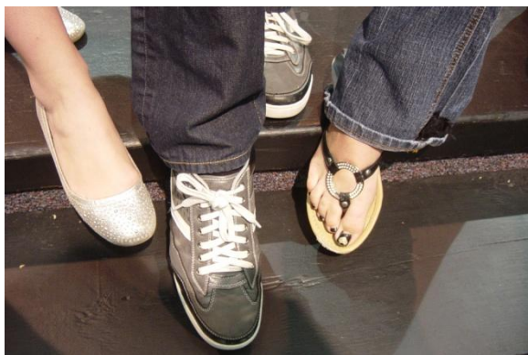
Middle shoe OK, outer shoes not!