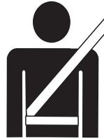
The right way to wear a safety belt.

The truth is safety belts save lives and reduce the risk of injury in a crash. Stories about the "dangers" or "hassles" of safety belts are simply unfounded.