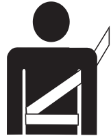
The wrong way to wear a safety belt.